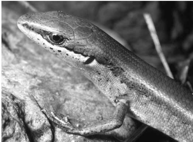
FIGURE 5 (right). Lateral view of the head a paratype of Lioscincus vivae , sp. nov. (AMR 163122) in life.

above passing through the labials to the ear, and recommencing behind the ear but fading towards the forelimb. Remainder of the lateral surface of the body (between the fore- and hindlimbs) grading from brown to gray (breaking into obscure pale blotches) towards the ventral surface. Side of head with numerous dark scattered spots to the headshields, and median and posterior labials each with large dark spots centered where the white midlateral stripe passes. Undersurface white, the throat and chest with fine, scattered, dark flecks.