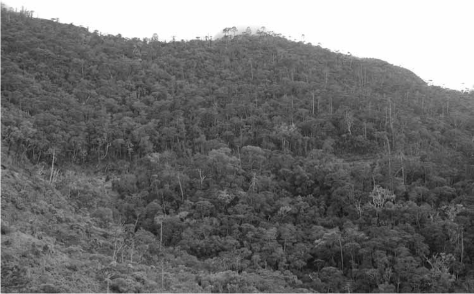
FIGURE 2. Isolated closed forest patch on the Massif de Kopéto typical of habitat in the area from which the types of Lioscincus vivae , sp. nov. and Nannoscincus manautei , sp. nov. were collected.

(AMS), California Academy of Sciences (CAS), and Muséum National d'Histoire Naturelle, Paris (MNHN). Radiographs were prepared using a Eresco AS2 X-ray machine to determine phalangeal formulae and the number of presacral vertebrae and postsacral vertebrae (complete original tails only) with exposures of 40 sec at 40 kV.