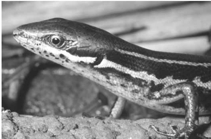
FIGURE 7 (right). Lateral view of the head of the holotype of Lioscincus vivae , sp. nov. (MNHN 2003.1003) in life.

Coloration of the single juvenile paratype is typical of adult females.