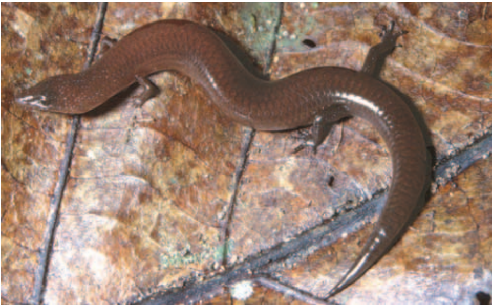
FIGURE 9. Dorsal view of a paratype (AMS R163123) of Nannoscincus manautei , sp. nov., in life.

RELATIONSHIPS. — Nannoscincus is a member of the Australasian Eugongylus group of lygosomine skinks (Greer 1979). It is distinguished from other genera in the group by a combination of morphological synapomorphies that includes: fusion of the atlantal arches and intercentrum of the first cervical vertebra into a single element; an elongate body with 29 or more presacral vertebrae; phalanges of digits of the forelimbs reduced, with a phalangeal formula of 2.3.4.4.3 or less for the manus (Sadlier 1990; Bauer and Sadlier 2000).