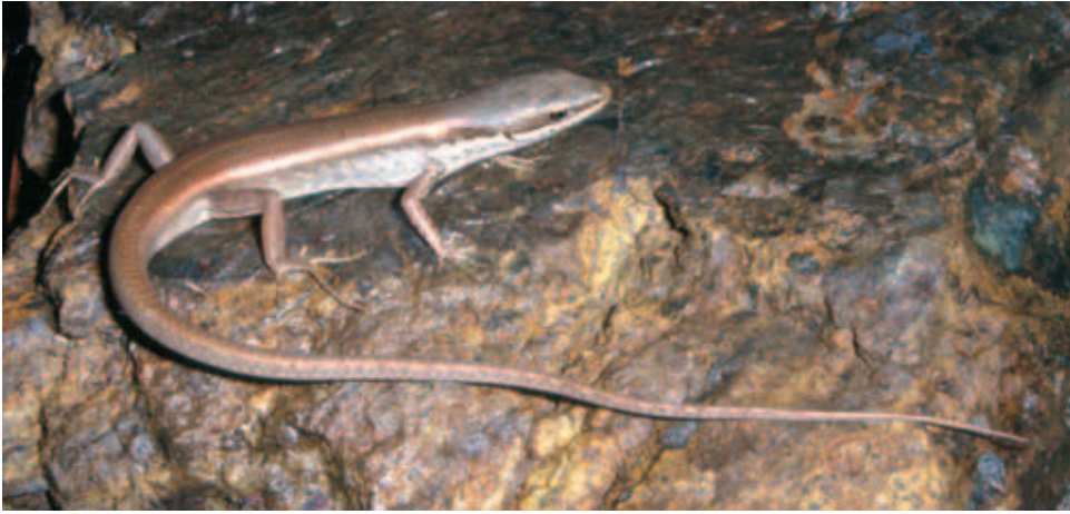
FIGURE 4 (above). Lateral view of a paratype of Lioscincus vivae , sp. nov. (AMR 163122) in life showing adult male color pattern and the long tail characteristic of the species.