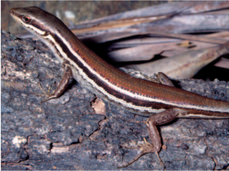
FIGURE 6 (above). Lateral view of the holotype of Lioscincus vivae , sp. nov. (MNHN 2003.1003) in life showing typical adult female color pattern.