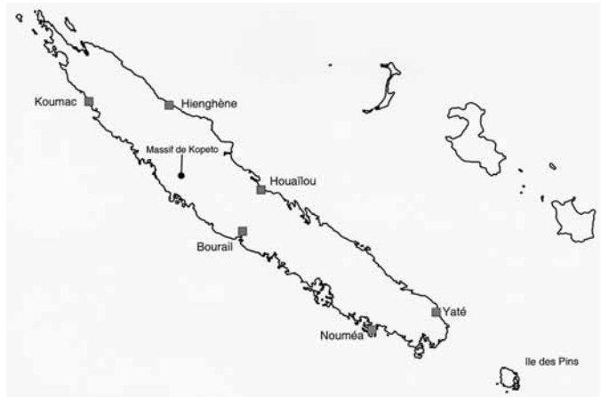
FIGURE 1. Map of New Caledonia showing location of Massif de Kopéto, type locality for Lioscincus vivae , sp. nov. and Nannoscincus manautei sp. nov.

The Massif de Kopéto, and the contiguous peak Paéoua (1144 m), are separated from the Massif de Koniambo to the north by the broad valleys of the Koné