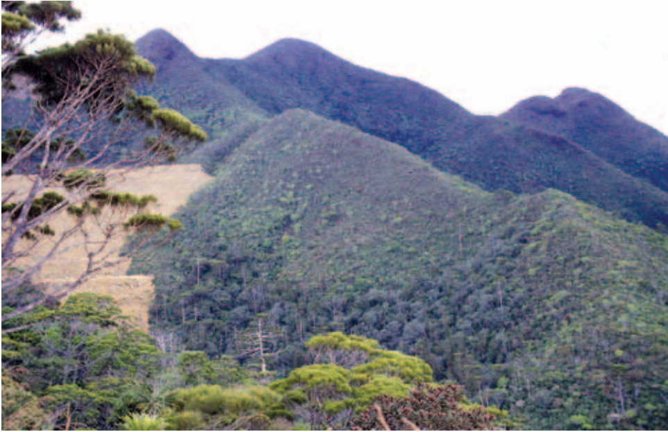
FIGURE 10. Patch of gully forest (bottom center) on the Massif de Kopéto illustrating disruption of adjacent forest associated with recent mining activity (left).

Given the steep terrain and the small size of the remaining forest patches, mining activity through or immediately adjacent to these forests has the potential to alter a significant proportion of the overall area of the habitat remaining for these lizard species.